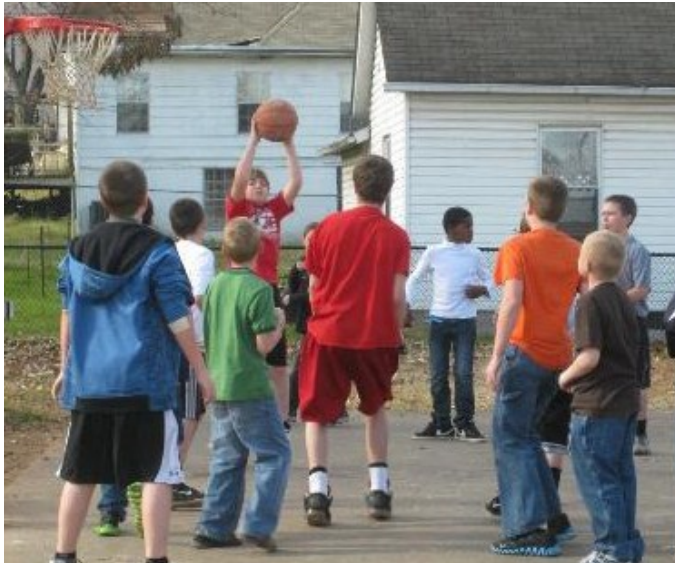
Our youth and downtown neighborhood kids make time for shooting some hoops while attending Water Angels Service.