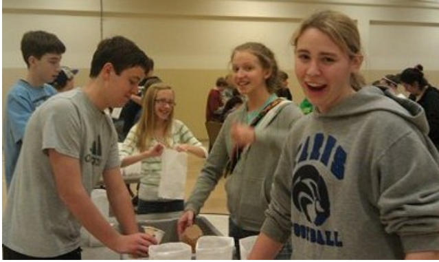
Youth prepare luminaries to light the walkways for our Christmas Eve Worship Services.