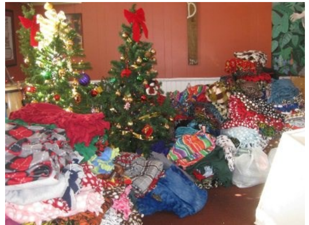
Over 255 blankets were given out to Knoxville's homeless community. Thank you, Beaver Ridge congregation, for doing your part!!