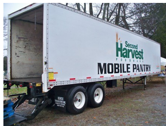
Our United Methodist Men help out Valley View UMC in their monthly food distribution.