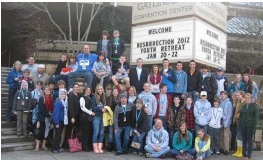
Thirty-nine Beaver Ridge youth and ten adults attended Resurrection last weekend in Gatlinburg.