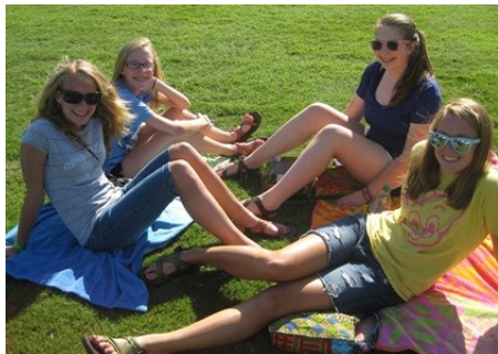
Waiting for concert to begin...

Our youth packed over 1700 meals in one hour! One million total meals were packed during the two day Worship in the City event. Meals will be distributed worldwide to impoverished families for Feed the Need and Kids Against Hunger.