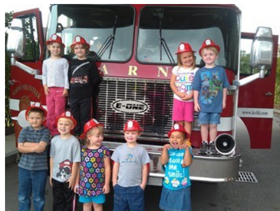
Preschoolers check out a real fire truck!