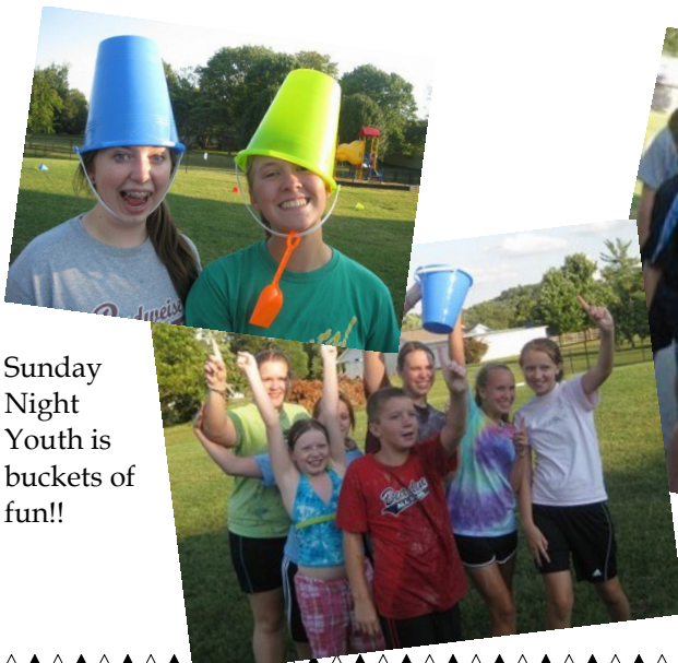
Sunday Night Youth is buckets of fun!!

Mystery Dinner Theatre - The Youth will serve as waiters and dishwashers. In return, we get 10% of the profits to put towards Resurrection. All youth that participate will get credit towards their "Resurrection Accounts". The more credit you get, the less you have to pay to go to Resurrection. More details coming.