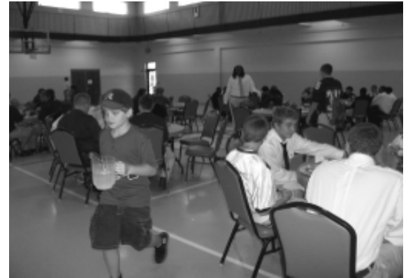
Beaver Ridge Youth fed over 100 football players, trainers, and coaches from Karns High School before their game against Oak Ridge.