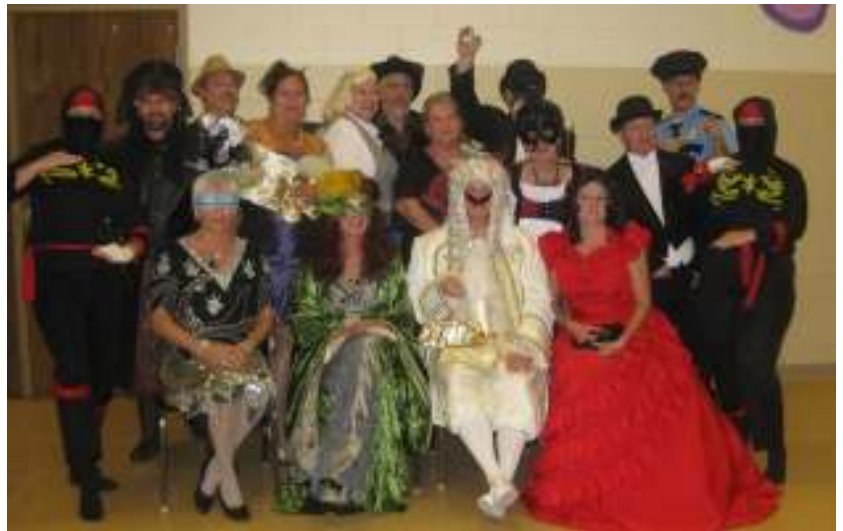
Cast of MISSIONaire's Mystery Dinner Theater