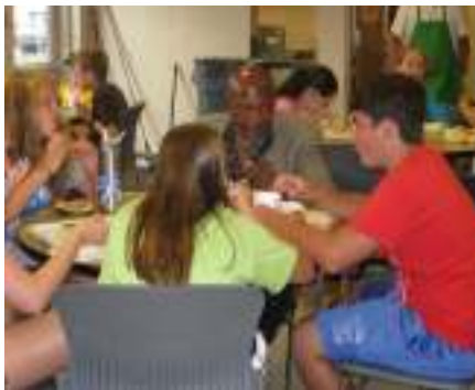
Everyone enjoys BINGO before supper at Volunteer Ministry Center.