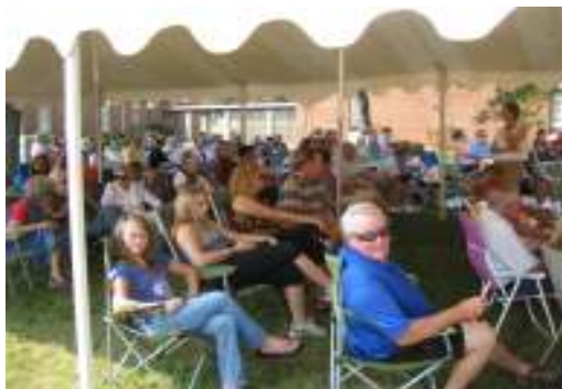
Worshippers stay cool underneath tent during July 4th outdoor service.