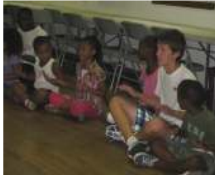
Youth lead games at Wesley House