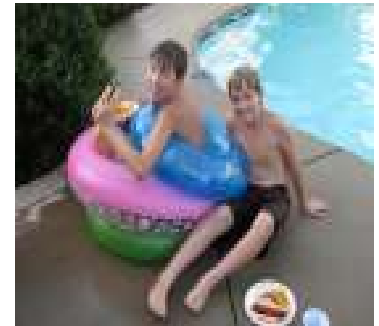
The Pool Party was a splash!