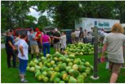
Beaver Ridge and other Oak Ridge District churches prepare to load watermelons onto trucks for delivery to food pantries and agencies.