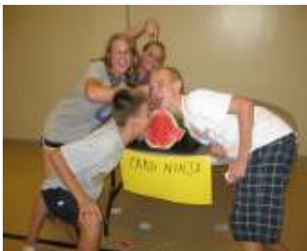
Lock In... "Minute to Win It" Games