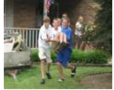
Rising sixth graders are "kidnapped" at beginning of Youth Week.