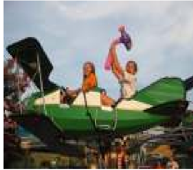
Good times at Zuma Fun Center

Thirty-eight middle school and high school students participated in this year's Youth Week. We began the week by "kidnapping" the rising 6th graders from their homes and welcoming them to youth group with some crazy games and fellowship. During the week, we were blessed with the opportunity to serve at Volunteer Ministry Center and Wesley House. At VMC, we led Bingo and also visited with the homeless men, women, and children at the center while we served and ate dinner with them. We also enjoyed an afternoon at Wesley House, providing an ice cream snack and playing games with the children there. There was time for a little fun during the week, too, with pool parties, go-carts and bumper boats at Zuma Fun Center, and cooling off in the World's Fair Park fountains. We wrapped up the week with an outdoor movie on the FLC wall and a Lock-In with lots of games, food, & shenanigans...but very little sleeping! It was a fun, exciting week but most of all it was a time to meet new friends, get to know each other a little better, and be in fellowship and service with one another. Alpha & Omega Youth, you rock!!